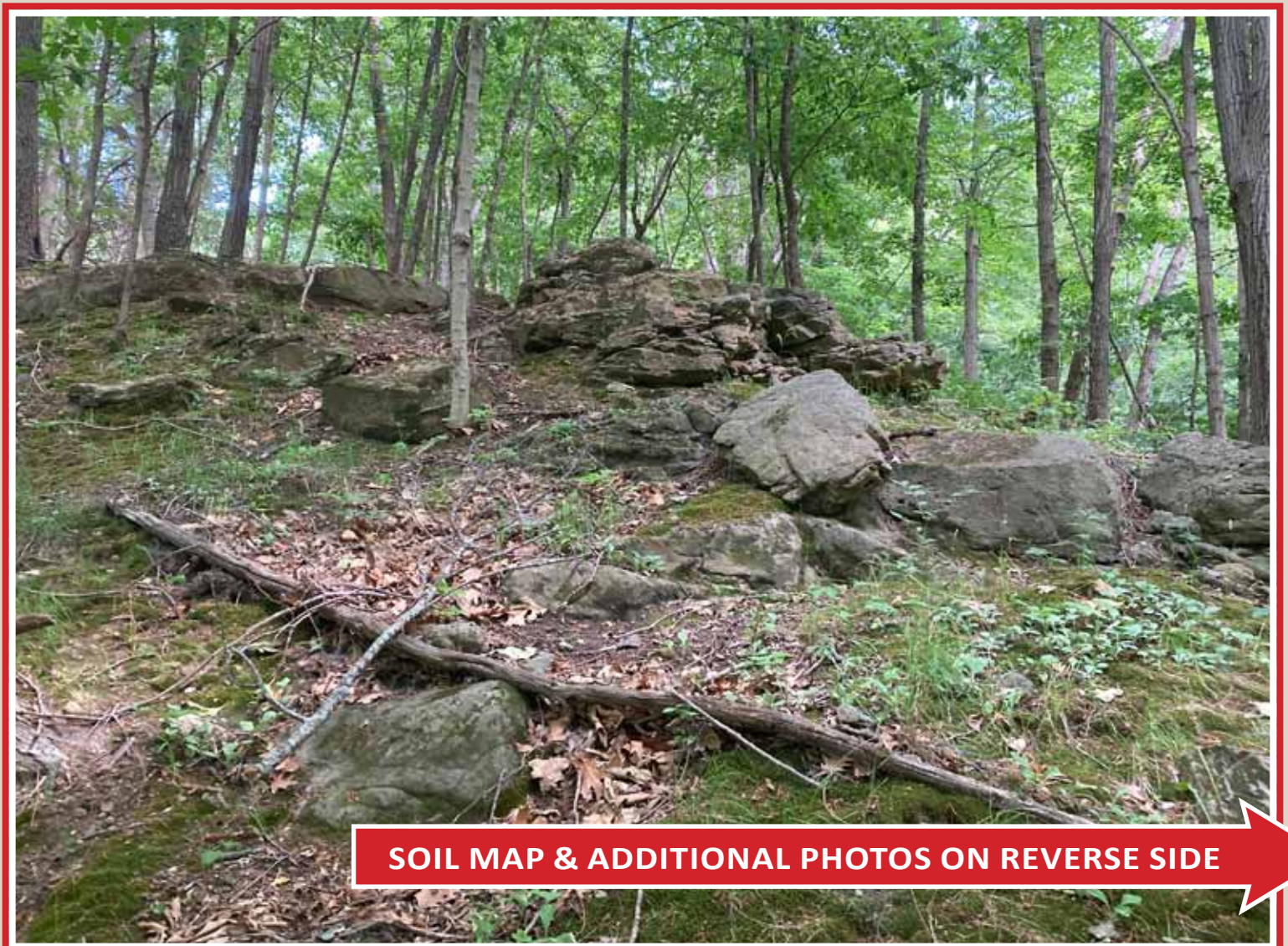
SOIL MAP & ADDITIONAL PHOTOS ON REVERSE SIDE